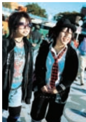
Expressive street fashions from The Tokyo Look Book .

things I've seen are bags covered in studs, headbands made of foxes—rather controversial—and lots of rips and tears, but there aren't many outfits and looks that are entirely customized. You would usually team something that either you or a shop had customized with some uncustomized brand goods.